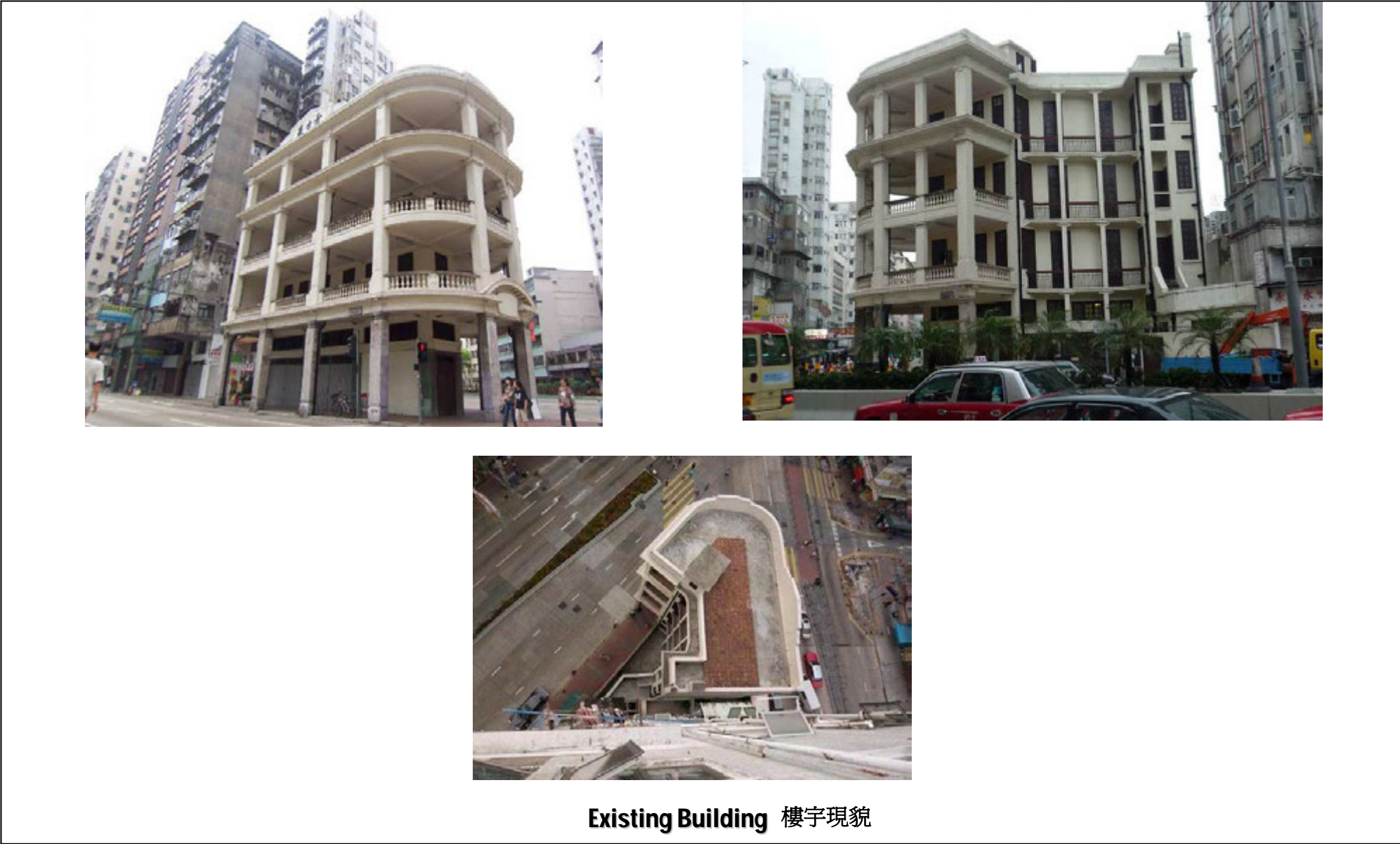
Existing Building 樓宇現貌

Revitalisation Scheme – Revitalising Lui Seng Chun as the HKBU Chinese Medicine and Healthcare Centre 活化歷史建築伙伴計劃 - 活化雷生春為香港浸會大學中醫藥保健中心