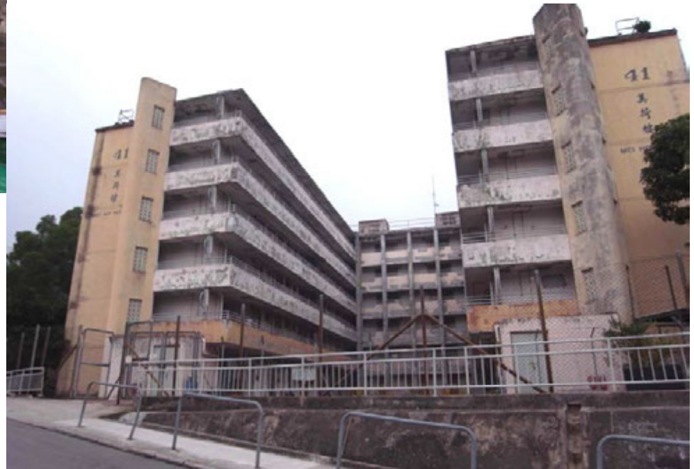
Existing Building 樓宇現貌

Revitalisation Scheme – Revitalising Mei Ho House as City Hostel 活化歷史建築夥伴計劃 – 活化美荷樓為城市旅舍