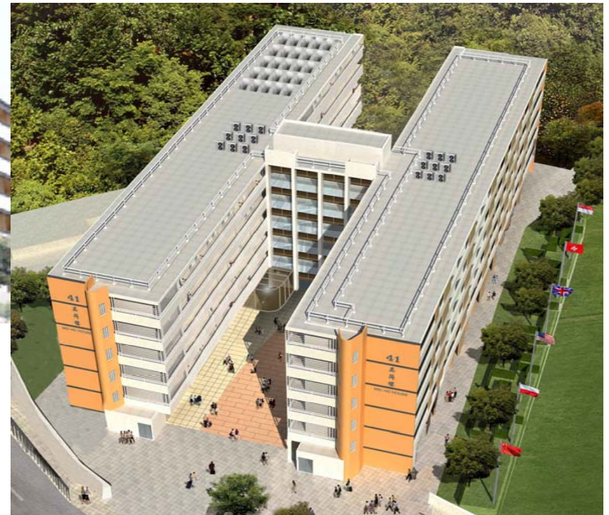
Artistic Impressions of the City Hostel 活化後模擬圖片

Revitalisation Scheme – Revitalising Mei Ho House as City Hostel 活化歷史建築夥伴計劃 – 活化美荷樓為城市旅舍