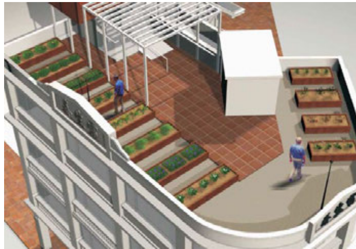
Artistic Impressions of the City Hostel 活化後模擬圖片

Revitalisation Scheme – Revitalising Lui Seng Chun as the HKBU Chinese Medicine and Healthcare Centre 活化歷史建築伙伴計劃 - 活化雷生春為香港浸會大學中醫藥保健中心